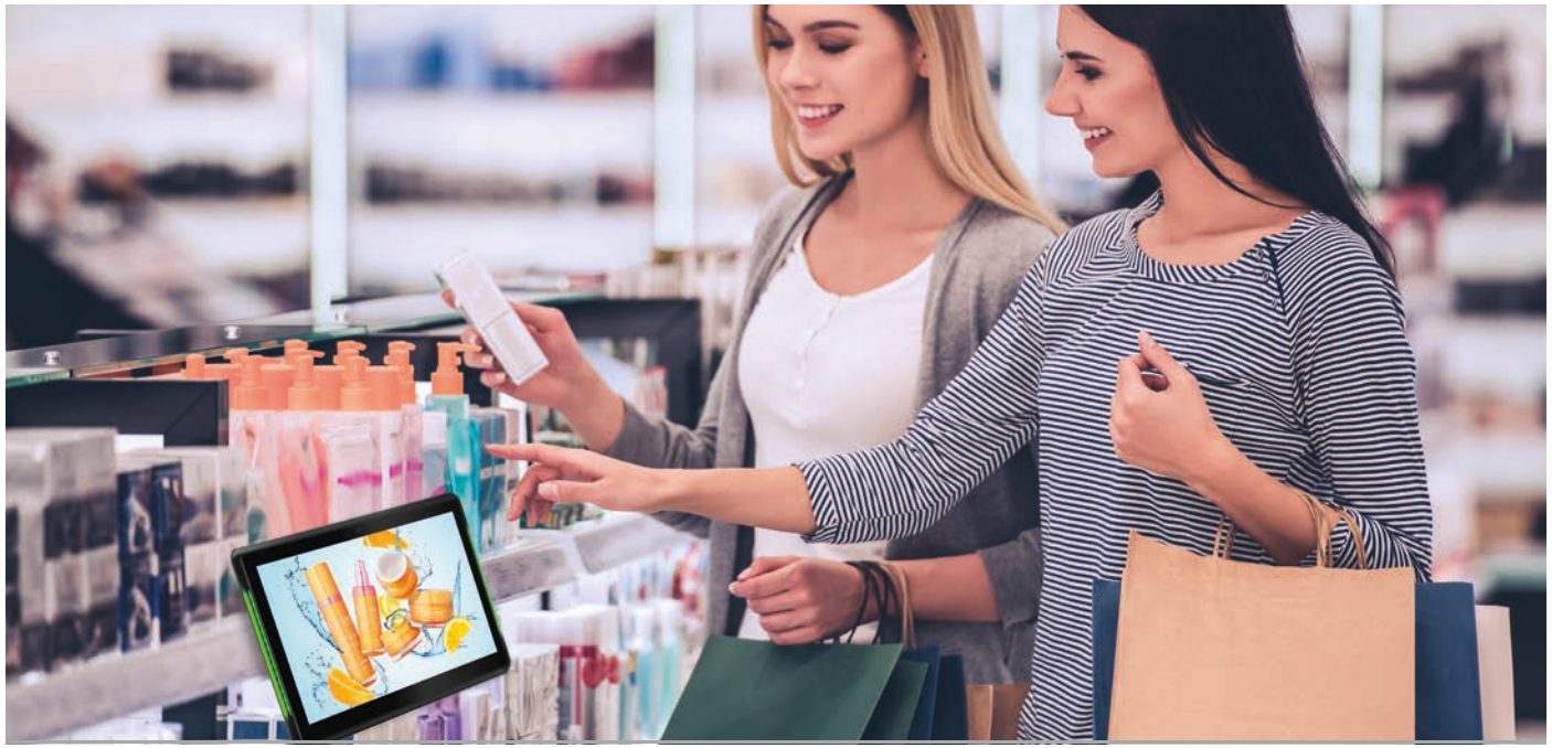
Errors and omissions excepted