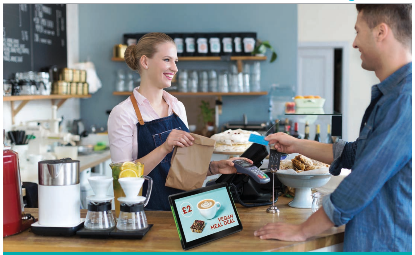
Tablet-sized commercial displays for retail shelf edge and point of sale applications