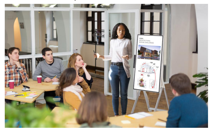
Employees can freely describe their creative ideas with drawing and writing.