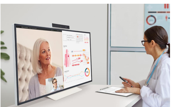
Perform simple consultations or medical examinations remotely without meeting with the patient.