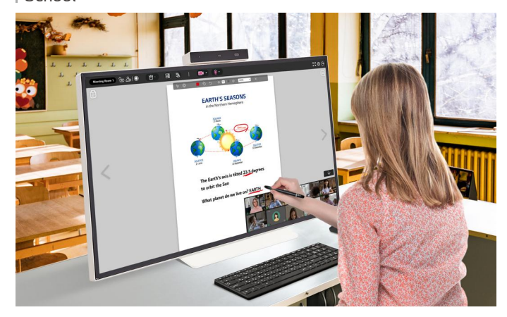
Write on teaching material and have remote lessons without any additional equipment.