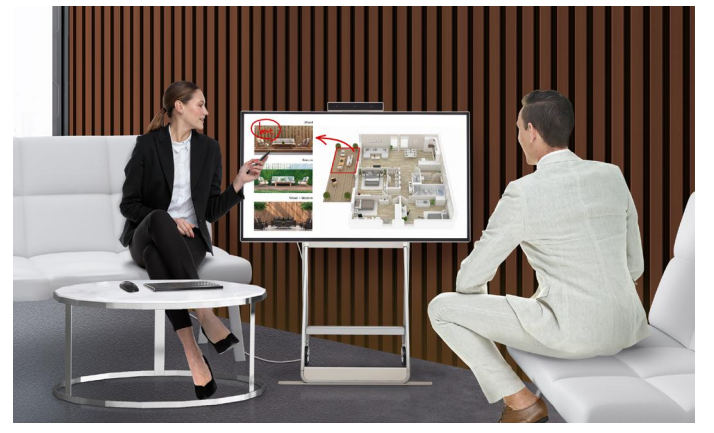
Have meetings and demonstrations with clients and contract in one place.