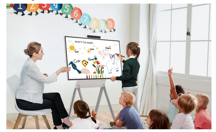
An interactive educational tool for the child, with which their drawings and writings from during class can be saved as image files.