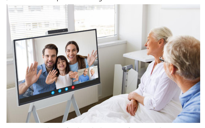
Re-connect with your family and relatives as if you were there.